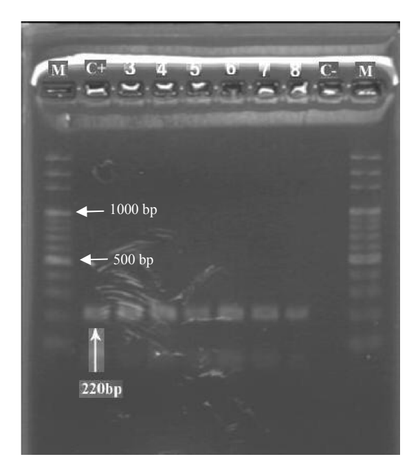
Figure 3. Positive samples of E. Histolytica .

Also, out of the 46 microscopic positive samples, 15 were positive by PCR. Figure 3 shows the bands of 220 bp of positive samples.